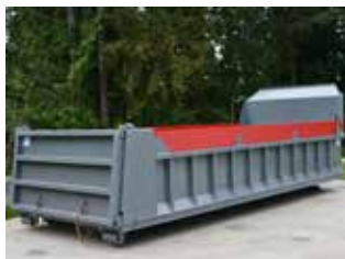
Dump Style Tailgate

To ensure the safety of your driver and truck, SCS offers an optional heavy duty cab guard for Rock Box Containers.