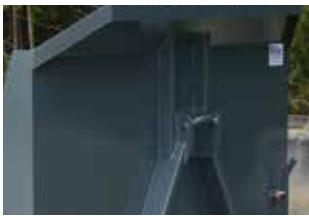
Rock Box Cab Guard

*Additional Options include Dual Purpose Systems and Narrower Widths For Nesting